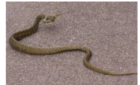
Wisemans Ferry: Anglican Church built 1890s using stone from 1840s ; Wildlife on by-roads, tortoise; diamond python.